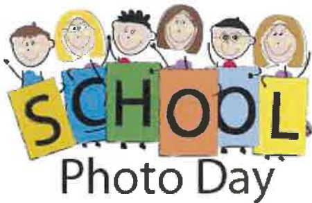
Photo Day is Thursday 25th May. You can view and purchase your child's photos online. A unique Photo Keycode will be sent home a couple of weeks after Photo Day. You use this to view and order your photos online. Sibling photo request forms are available from the School Office.