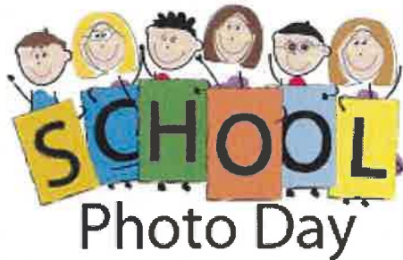
Photo Day is Thursday 25th May. You can view and purchase your child's photos online. A unique Photo Keycode will be sent home a couple of weeks after Photo Day. You use this to view and order your photos online. Sibling photo request forms are available from the School Office. Please ensure your child wears the correct uniform to school for Photo Day.