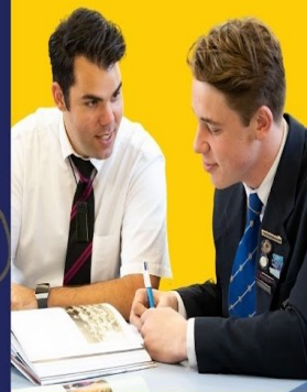
PREPARING YOUNG MEN FOR LIFE