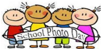
Photo Day is Wednesday 29th May. You can view and purchase your child's photos online. A unique Photo Keycode will be sent home a couple of weeks after Photo Day. You use this to view and order your photos online. Sibling photo request forms will be sent home with the students today. If you wish to order a sibling photo please complete the form and return to the school office before photo day. Please ensure your child wears the correct uniform to school for Photo Day. (In fact everyday).