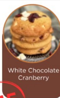
White Chocolate Cranberry